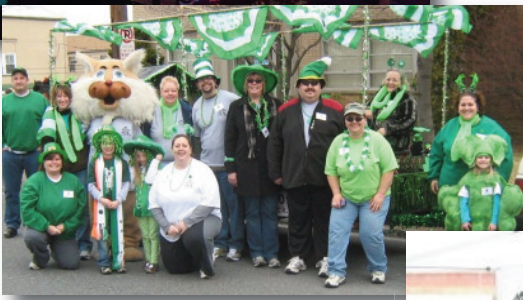
Volunteers at the Halloween Parade in Upper Perk, St. Patrick's Day Parade in Bethlehem and Vegfest in Bethlehem!